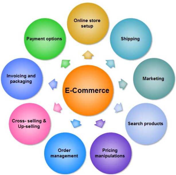
Figure 1. E-commerce concept

Access and look at the reality of the business environment in Libyan, the existence of a set of manifestations which indicate the presence of problems. Theseproblems include: